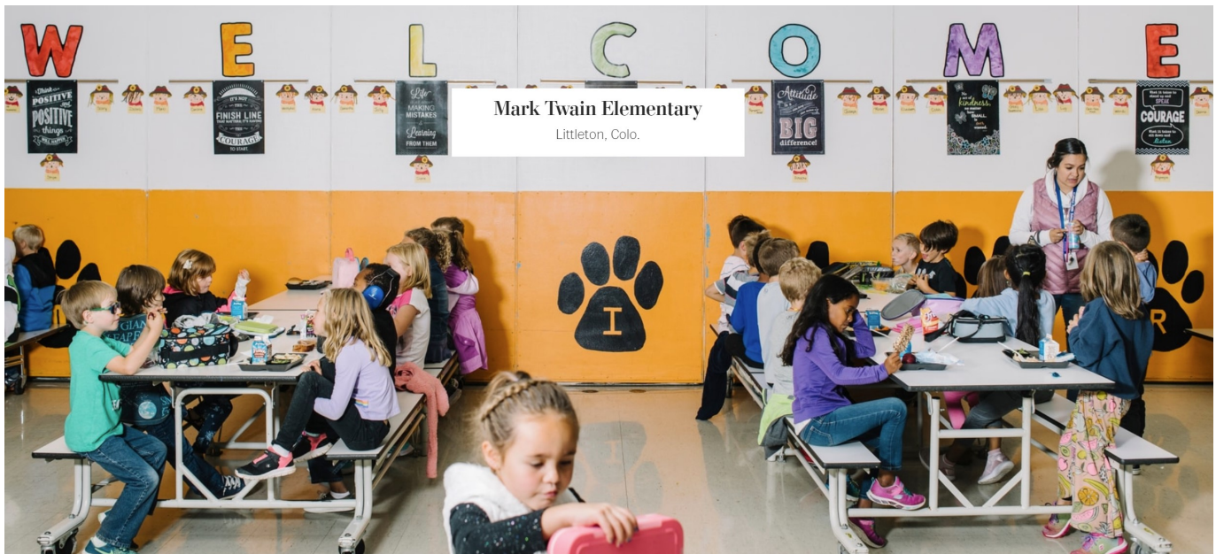
Mark Twain Elementary Littleton, Colo.

https://www.washingtonpost.com/graphics/2019/food/school-lunches-in-america/